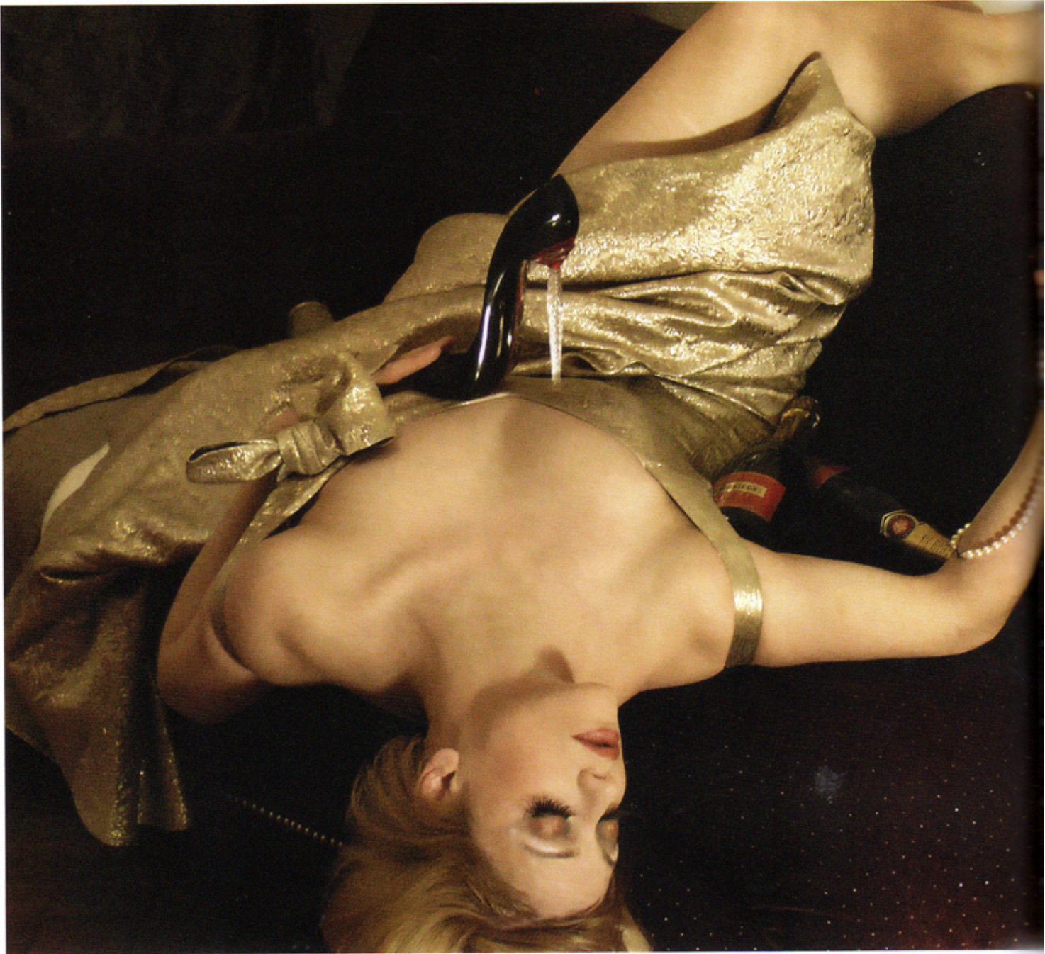
Salon K Privé Sarah Grether